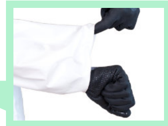
Lastikli el bilekleri. Elasticated wrists.