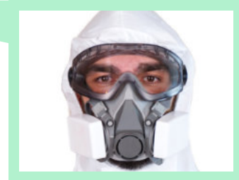
Elasticated hood that fully encloses facial equipment.